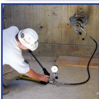
National on Site Anchor Testing Service