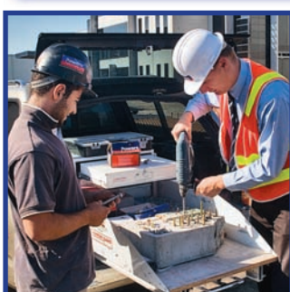
National On Site Service Powers Training Vehicles (PTV)

Chem-Stud® Hammer Capsule® High performance Economical Versatile Epoxy acrylate resin