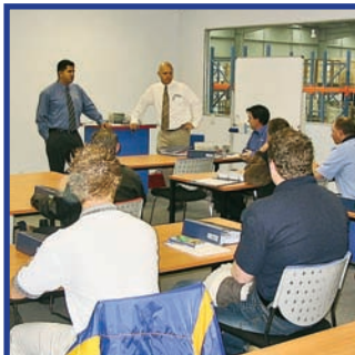
Training Facility Melbourne

Power-Fast® PRO Heavy duty Odourless Epoxy anchoring adhesive