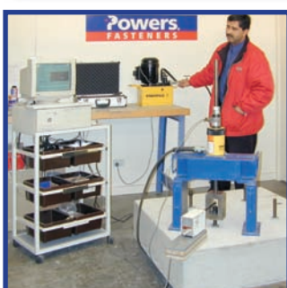
In-house Product & Application Testing Service Melbourne

AC100® PRO High performance. Fast cure Styrene free